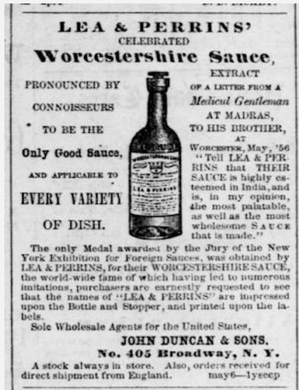
Pictorial advertisements began showing up all over the world as noted in this 1858 example.