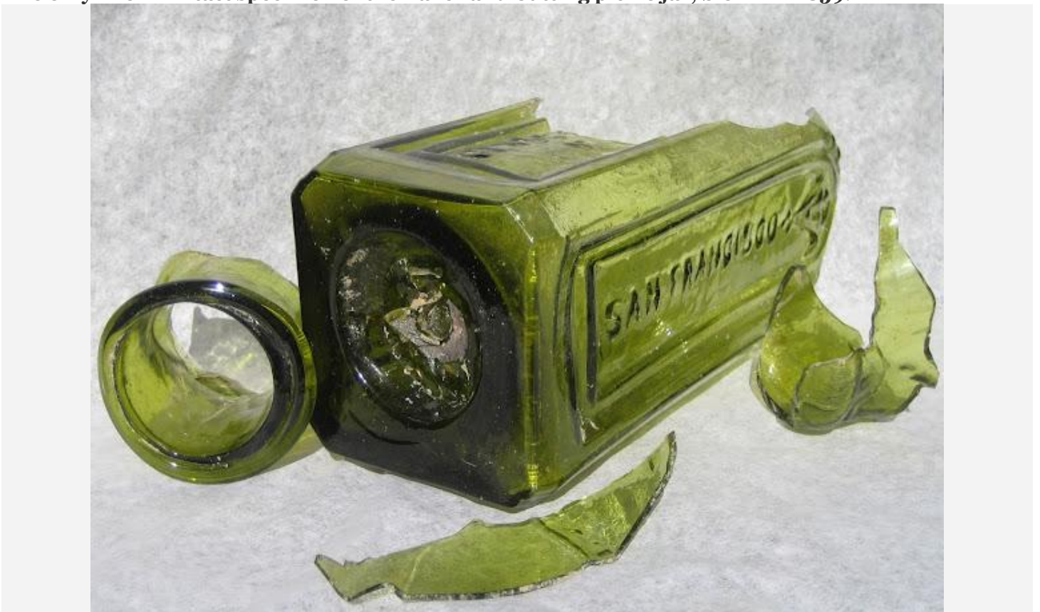
A surprisingly large number of the Baker & Cutting pickle bottles have been excavated over the years, except all but one have been found in pieces.