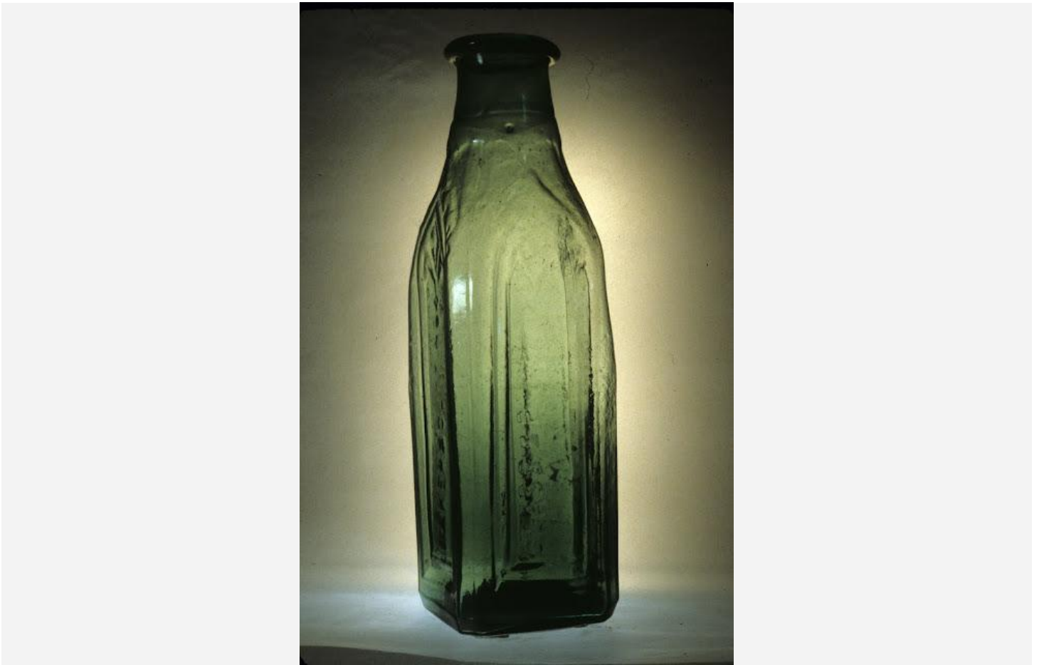
The only known intact specimen of the Baker and Cutting pickle jar, blown in 1859.